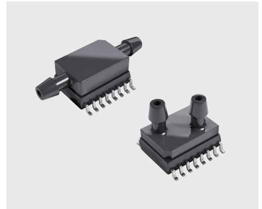
SMI Low Pressure Digital/Analog Sensor

For years, piezoresistive sensor technology has been perceived as the low-risk option for HVAC applications. Air handling systems are dusty places and piezoresistive sensors do not have a flow channel, so dust will not hinder its performance. The technology has high sensitivity and is suitable for applications requiring a measurement range of 1 millibar (0.5 inches of water column) to 10 bar. Piezoresistive sensors have high linear signal-pressure characteristics and excellent overall accuracy, and they come in very small sizes for compact applications.