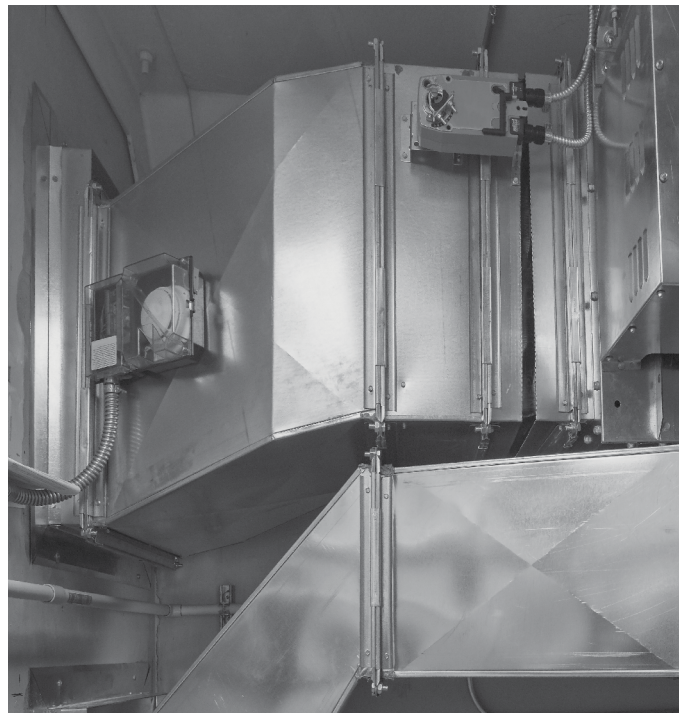
Variable air volume dampers

The air handler's blower fan must modulate to vary the air flow depending on demand. The VAV box has a sensor inside to measure air flow. The air flow and temperature variables control damper position based on temperature and cubic-feet-per-minute (CFM) demands. An additional sensor inside the main supply duct measures air pressure. There is a pressure set point inside the control program for the air handler. The air handler's controls will ramp the blower up and down depending on the duct pressure to maintain the set point in the program.